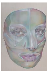
Lisse Declercq Pearly Shell , 2023 Oil on linen 150 x 100 cm 59 x 39 3/8 in