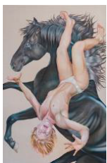
Lisse Declercq Direction to Perfection , 2023 Oil on linen 200 x 130 cm 78 3/4 x 51 1/8 in