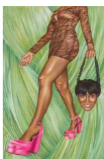
Lisse Declercq It girl - It Bag , 2022 Oil on linen 200 x 135 cm 78,74 x 53,15 in