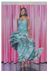
Lisse Declercq Glamour et l'Amour , 2023 Oil on linen 200 x 130 cm 78 3/4 x 51 1/8 in